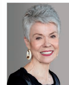
Yours in fashion Faye Founder Est. 1991